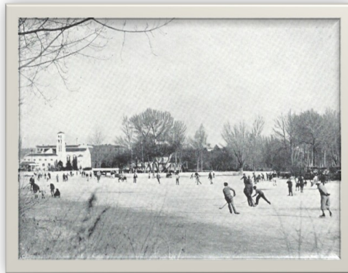
~ Ice Skating on the Truckee River 1932 ~

A visit with members of the Gosse and Mudd Families